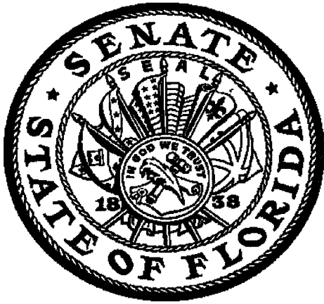
The Florida Senate